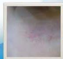
CLINICAL IMPROVEMENT IN SCAR TISSUE